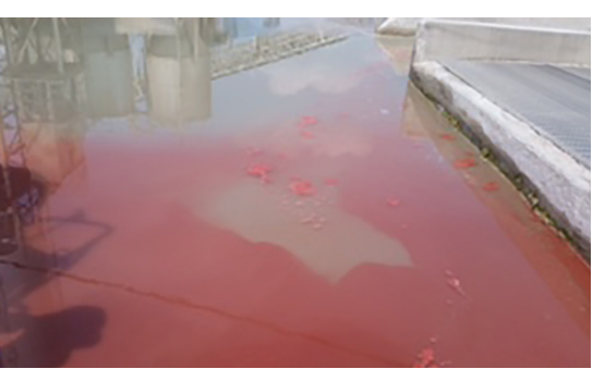
Pigment Migration in Retention Pit

When a brick manufacturing facility was unable to reuse their water due to high solids content and pigments, they turned to CETCO for a solution. Utilizing RM-10 flocculants allowed them to treat their process water on-site.