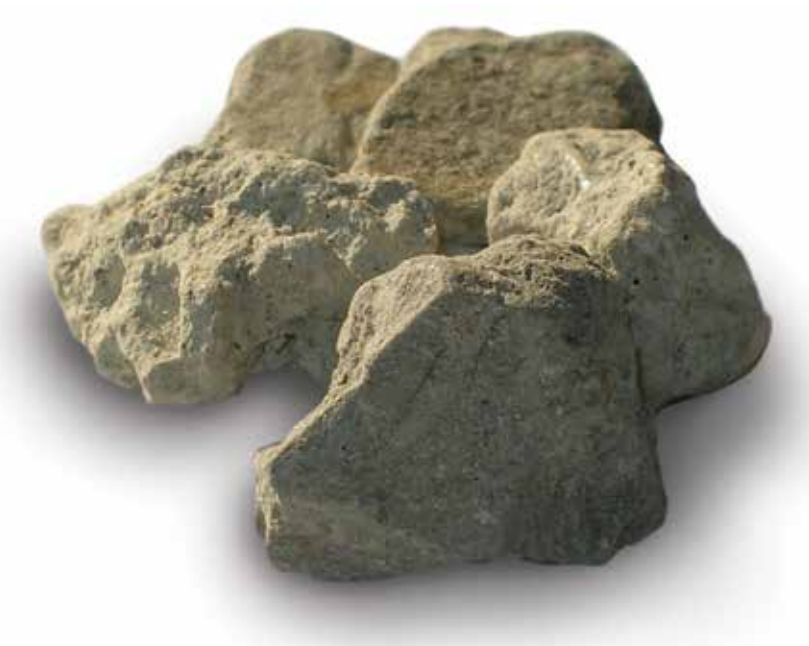
PUREGOLD MEDIUM CHIPS

is a specially blended high solids bentonite that can be mixed with sand in a two-part, thermally conductive grouting material to improve the performance of ground source heat loop applications. HIGH TC GEOTHERMAL GROUT is an easy pumping grout that has been carefully developed to efficiently suspend silica sand for enhanced thermal conductivity. HIGH TC GEOTHERMAL GROUT can be mixed to meet a range of thermal conductivity (TC) from 0.40 to 1.21 Btu/hr/ft/F (0.68 to 2.05 W/mK). NSF/ANSI/CAN Standard 60 Certified.