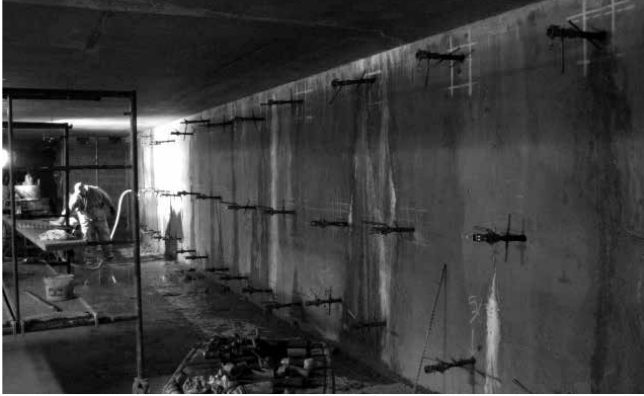
INTERIOR SURFACE GROUT INJECTION: BENTOGROUT is applied to the inside of the building without excavating the site.