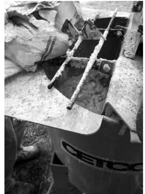
Mixing BENTOGROUT in CETCO mixer.

Limitations: BENTOGROUT is not designed to bridge cracks or gaps larger than 3 mm (1/8"). Interior surface cracks greater than 3 mm (1/8") should be surface sealed with cement based patching material to prevent grout extrusion into the structure. BENTOGROUT is not designed as a structural patch. BENTOGROUT is not recommended for above grade or applications that do not provide proper confinement. BENTOGROUT is not suitable for sealing expansion joints.