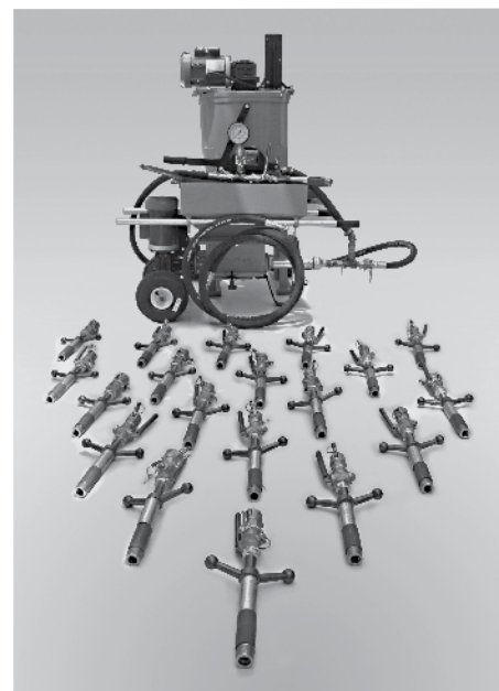
CETCO BENTOGROUT Pump, Mixer and Accessories.

Caution: Pumping any material under pressure can cause lifting or movement of adjacent structures.