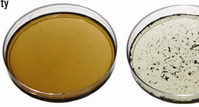
ENERSOL in Liquid Fertilizer

Unlike extracted humic products, ENERSOL is compatible with liquid fertilizer.