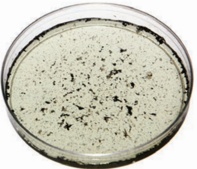
Extracted humic product in Liquid Fertilizer

Both mixtures were agitated for two minutes.