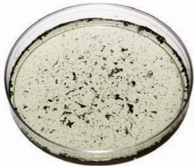
Extracted humic product in Liquid Fertilizer

Both mixtures were agitated for two minutes.