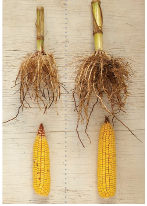
ENERSOL treated corn have a larger root system, increased crop yields and larger, bigger leaves.