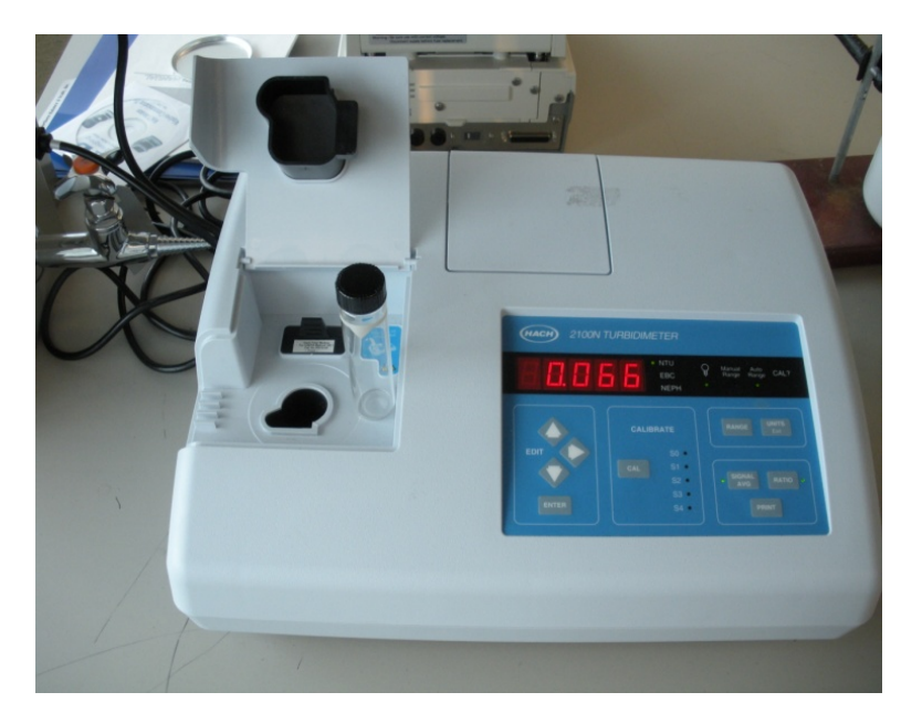
Benchtop model with multiple detector arrangement and accurate between 0-4000 NTU

Portable style with single 90° detector- Accurate between 0-100 NTU without need for dilution of sample