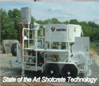
State of the Art Shotcrete Technology