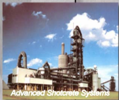
Advanced Shotcrete Systems