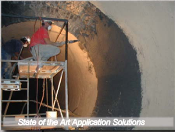
State of the Art Application Solutions