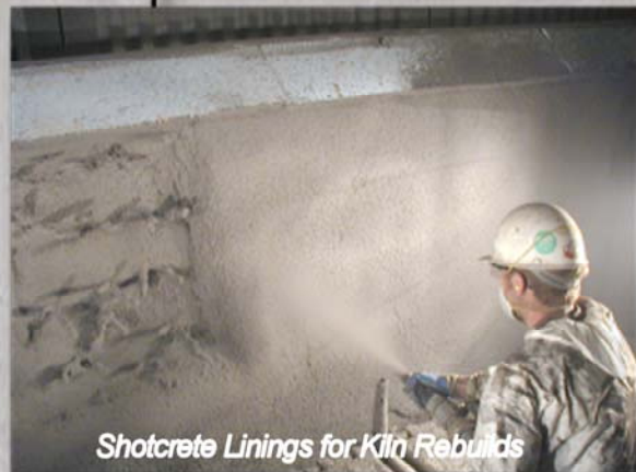
Shotcrete Linings for Kiln Rebuilds

MiNTEQ International Inc. 640 North 13th Street Easton, PA 18042 Phone: (610) 250 - 3036 E-mail: minteq.productinfo@minteq.com