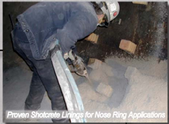
Proven Shotcrete Linings for Nose Ring Applications